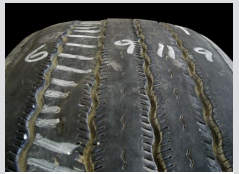
Depression Wear (Intermediate)