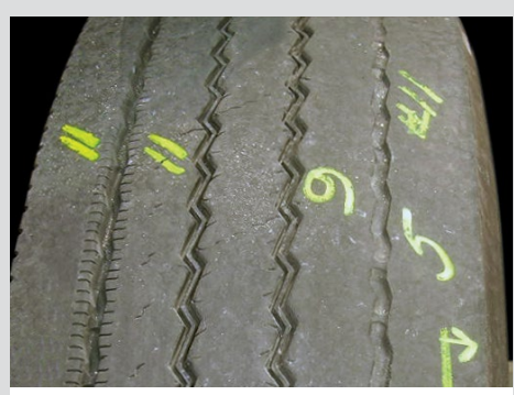
One Sided Wear